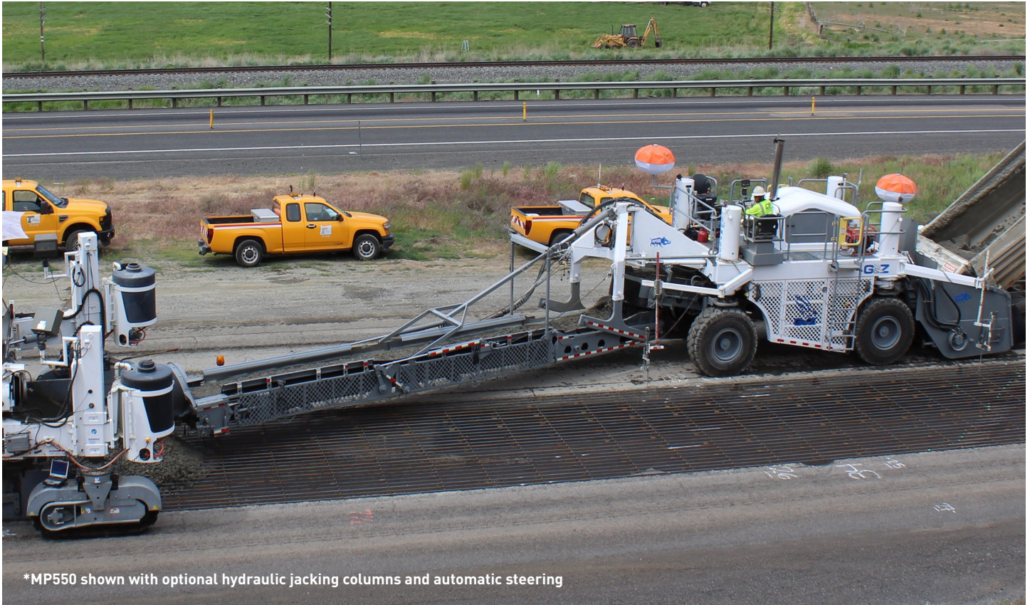
*MP550 shown with optional hydraulic jacking columns and automatic steering