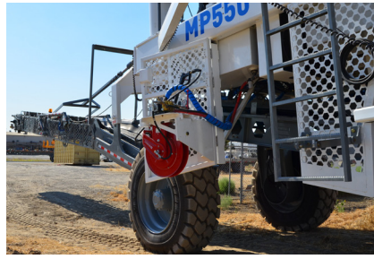
SWING OPEN SIDE PANELS