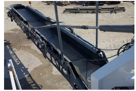
EASY TO CHANGE VULCANIZED BELTS

G&Z's MP550 conveyors and their components are readily accessible and easy to clean and maintain to keep operating costs low. The hopper has been designed with a hydraulic quick-release mechanism to allow the carrier to safely walk away from the hopper for ease of access, cleaning, loading or switching to other attachments. For daily cleaning and maintenance, the carrier side access panels safely guard the transfer conveyor during operation and provide excellent access through the provided doors. The tail end of the Transfer Conveyor can quickly be lowered hydraulically (or even disconnected) from the bottom of the hopper for ease of cleaning and maintenance. Each conveyor has also been meticulously designed to allow the vulcanized belts to be easily replaced.