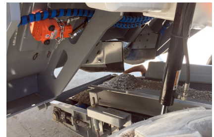
EASY ACCESS TRANSFER BELT

The MP550 is outfitted with the latest 6-cylinder CAT C7.1 US EPA Tier 4 Final / EU Stage V 302 hp (224 kW) diesel engine. The engine also features quiet operation, low fuel consumption, as well as extended service intervals. The "Eco-Mode" feature on the MP550 reduces fuel consumption by up to 35%. Low maintenance tires are standard; however, high drive rubber tracks are available as an option. Because the two conveyors are accessible and easy to clean, the high operating costs associated with concrete belts on placers are dramatically reduced. The MP550 is also designed to be quick and easy to transport. The swing conveyor hydraulically folds up for transport and high speed travel around the jobsite. Optional jacking columns are available on the MP550 along with an auto level control system. This option allows ground clearance to be dramatically increased under the conveyors for maneuvering around the site, loading the machine and cleaning, as well as dealing with other clearance issues caused by uneven ground or ramps.